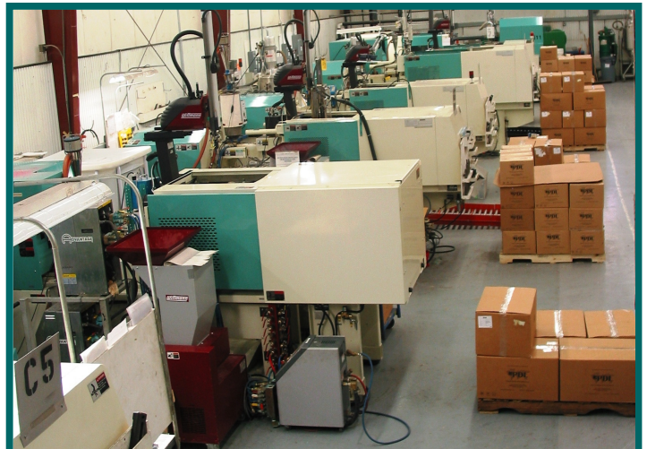
Industrial Park Road: Shop Floor circa 2011