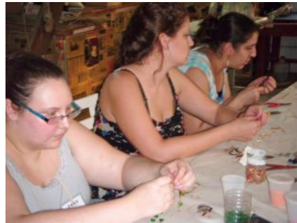
Above: Basket weaving and bead making Below left: Kakum National Park's Canopy Walk Below right: cuddling a local puppy (it's so cute!)